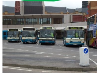
Central bus stations