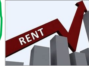
Lack of affordable housing