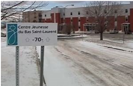
Youth protection services