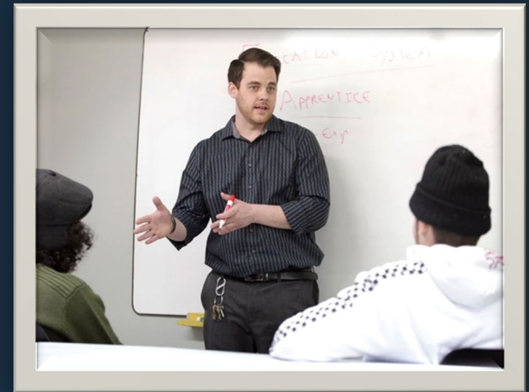
YIP lesson being taught