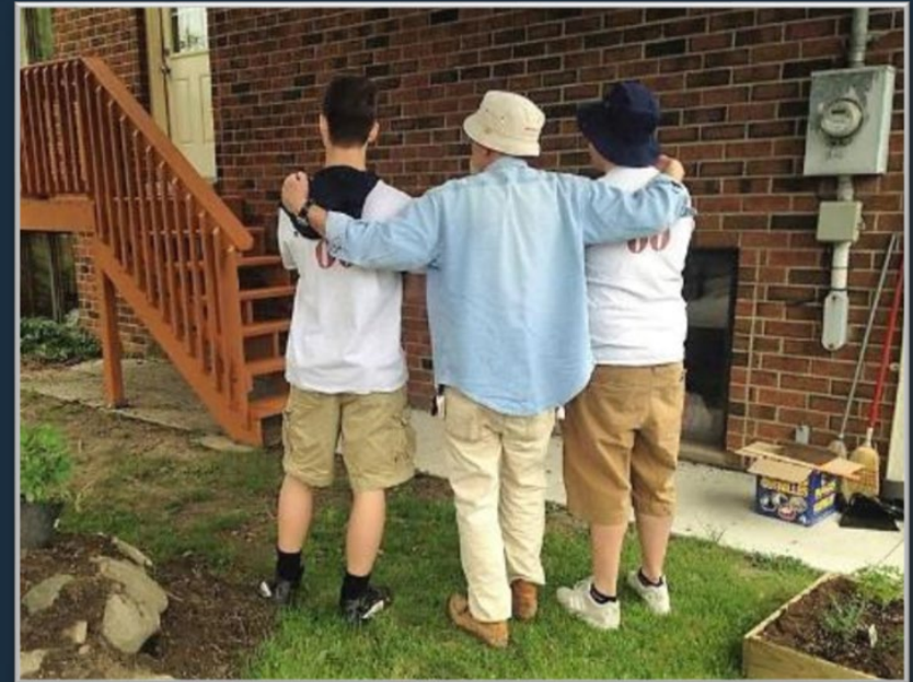
WRYM past residents at work