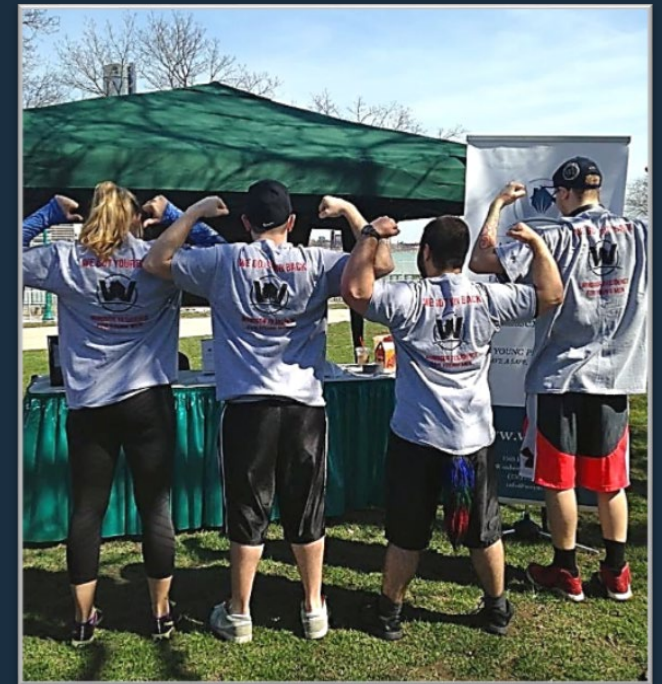
WRYM residents volunteering