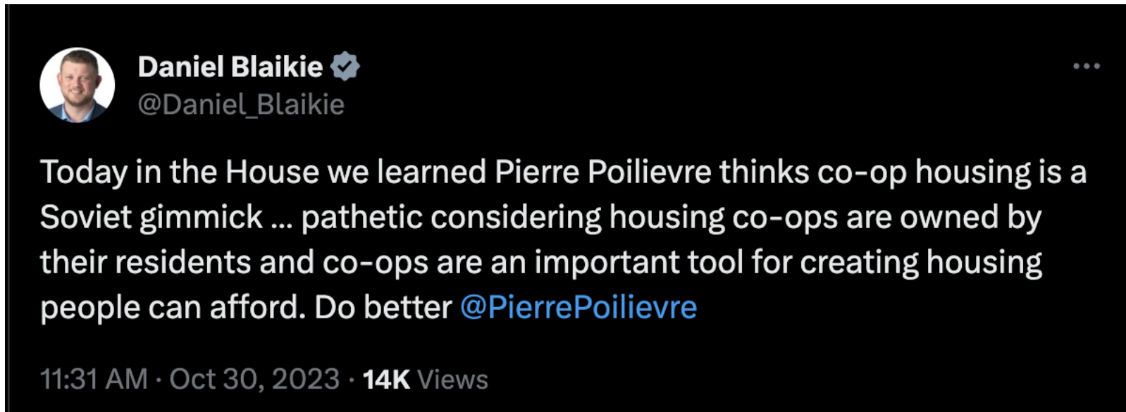
Photo: Daniel Blaikie on X