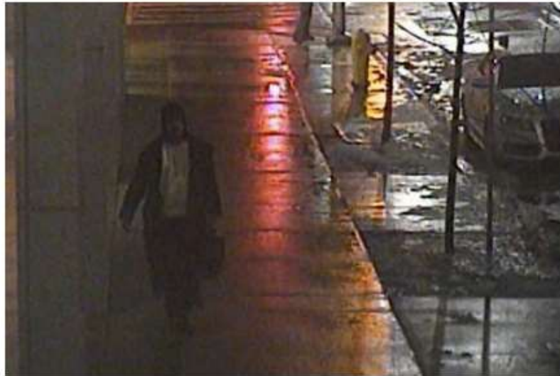
Police photograph of a man sought in connection with a string of downtown sexual assaults last month. Homeless advocates say such incidents are why Toronto needs a 24-hour drop-in space for women.